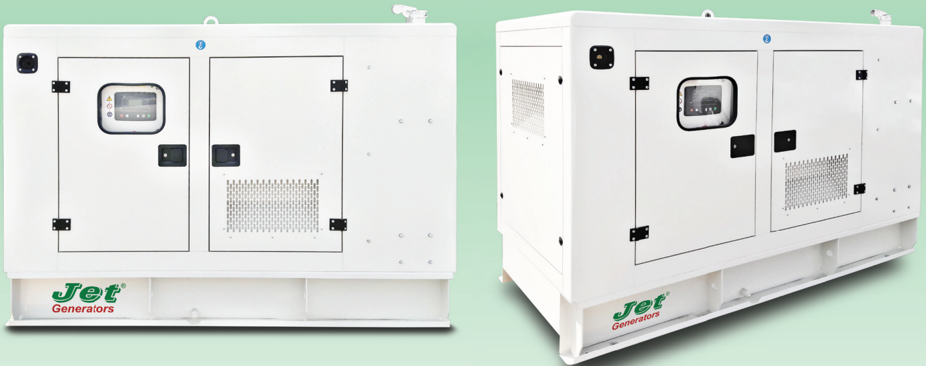
Enclosures pictured may include optional accessories.

JET sound-attenuated and weather-protective enclosures are manufactured from galvanized steel sheet (polyester powder painted for rust proof protection). The heavy duty silencer is mounted internally for enhanced performance.