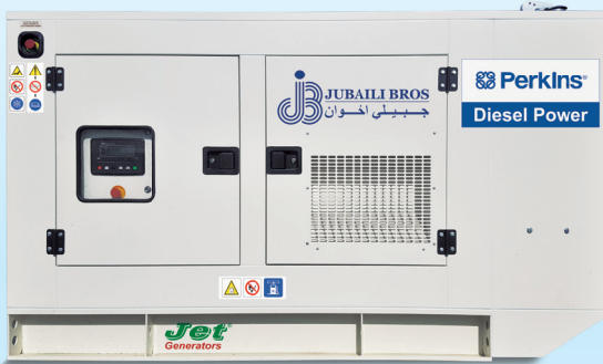
Tested at 40 degrees temperature Enclosures pictured may include optional accessories.

Double Deck Enclosures allow maximum use of space in a 40 ft. HC Container.